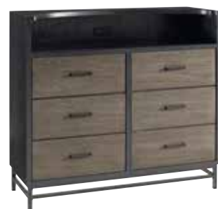
DRESSING CHEST 5322004 / 48w x 18d x 44h Six drawers. Removable dividers in the drawers. Smoked mirror top shelf. Power outlet. Metal base. Shown on page: 7