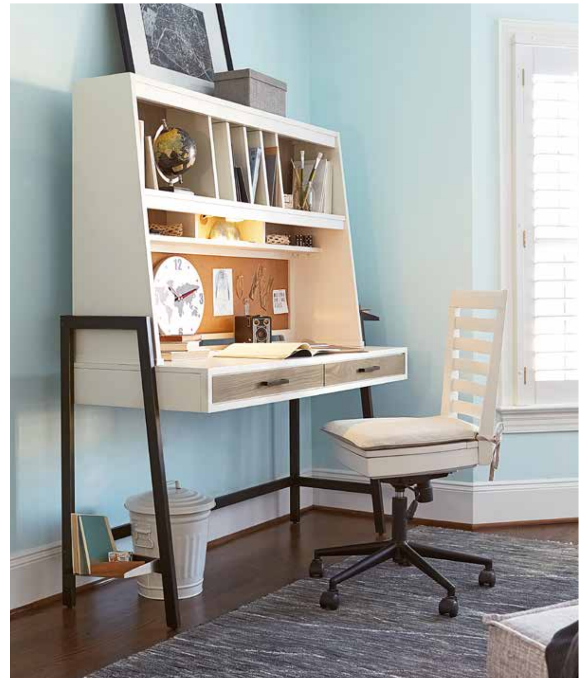
HUTCH 5321020 / 53w x 14d x 35h