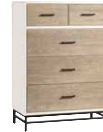
DRAWER CHEST 5321010 / 36w x 18d x 50h Five drawers. Top right drawer has a felt tray/hidden storage. Removable drawer dividers in the larger drawers. Back panel with jewelry hooks slide out from right side only. Metal base. Shown on page: 24