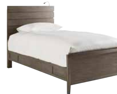
READING BED 5322035 / 3/3 Twin 43w x 80d x 47h 5322040 / 4/6 Full 58w x 80d x 47h (footboard height is 22") LED flex reading light in headboard. Shown on pages: 12, 18