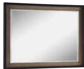
MIRROR 5322032 / 30w x 2d x 40h 1" bevel glass. Shown on page: 9