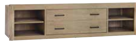
STORAGE UNIT 5321061 / 20w x 76d x 20h Integrates into any bed. Usable on left or right side. One large drawer with removable divider. One adjustable shelf in each open area. One storage unit and one rail shipped per order (up to two storage units can be used per bed).