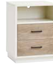
NIGHTSTAND 5321080 / 21w x 18d x 28h Flip top with power outlet. Two drawers. Open storage area. Light under case. Shown on pages: 4, 25, 32