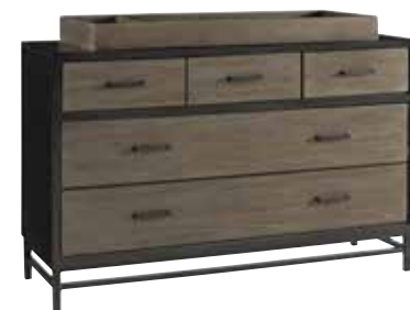
CHANGING STATION 5322200 / 43w x 18d x 5h Shown with 5322002 Dresser. Shown on page: 23