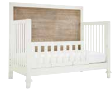
TODDLER BED CONVERSION KIT 5321305 / 58w x 3d x 33h Kit works with convertible crib to create Toddler or Day Bed. Shown on page: 37