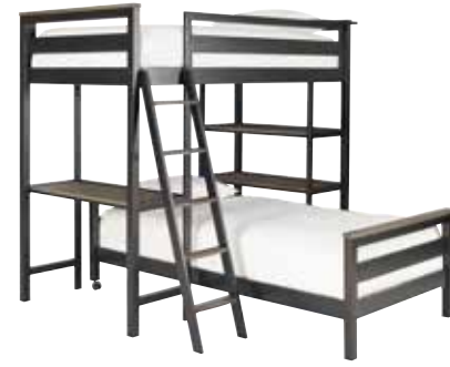
METAL LOFT BUNK BED 5322630 / 81w x 81d x 71h Includes loft, twin metal bed and ladder.