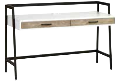
DESK 5321027 / 56w x 22d x 36h Two drawers. One felt lined storage tray. Metal frame. Shown on pages: 4, 31