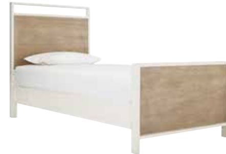
PANEL BED 5321037 / 3/3 Twin 41w x 82d x 50h 5321042 / 4/6 Full 56w x 82d x 50h (footboard height is 26") Shown on pages: 4, 25