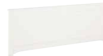
LOW PROFILE FOOTBOARD 5321284 / 58w x 3d x 22h Works with convertible crib to create full size bed that can accommodate under bed storage with use of this footboard. Shown on page: 37