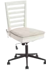
SWIVEL DESK CHAIR 5321071 / 26w x 26d x 37h Upholstered seat pad. Storage under seat pad. Shown on pages: 4, 31, 34