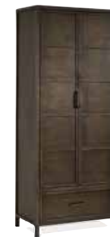
VARSITY METAL CABINET 5321014 / 28w x 19d x 71h One drawer. Four shelves. All metal design. Shown on page: 14