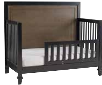
TODDLER BED CONVERSION KIT 5322305 / 58w x 3d x 33h Kit works with convertible crib to create Toddler or Day Bed. Shown on page: 22