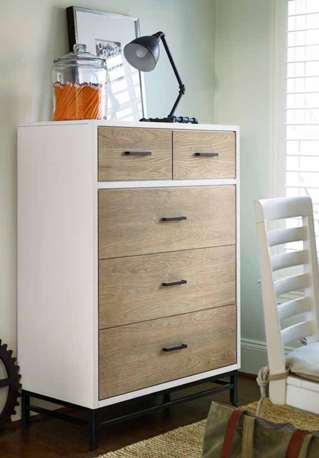
DRAWER CHEST 5321010 / 36w x 18d x 50h