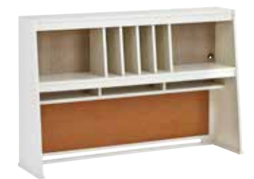
HUTCH 5321020 / 53w x 14d x 35h Removable dividers. Cork back panel. Cord exit in back panel. Shown on page: 31