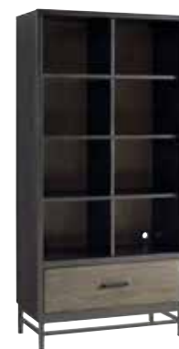
BOOKCASE 5322018 / 31w x 16d x 65h Three adjustable wood shelves. Cord exits in back panel. One drawer. Metal base. Shown on page: 16