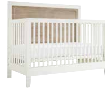
CONVERTIBLE CRIB 5321310 / 56w x 30d x 48h Shown on page: 36