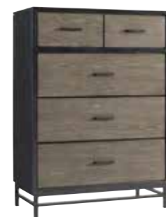
DRAWER CHEST 5322010 / 36w x 18d x 50h Five drawers. Top right drawer has a felt tray/hidden storage. Removable drawer dividers in the larger drawers. Back panel with jewelry hooks slide out from right side only. Metal base. Shown on pages: 13, 15