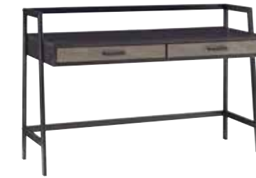
DESK 5322027 / 56w x 22d x 36h Two drawers. One felt lined storage tray. Metal frame. Shown on pages: 8, 10, 19