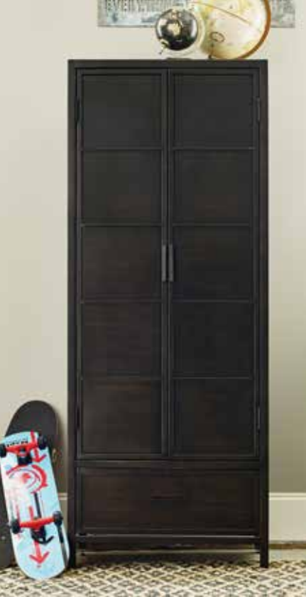
VARSITY METAL CABINET 5321014 / 28w x 19d x 71h