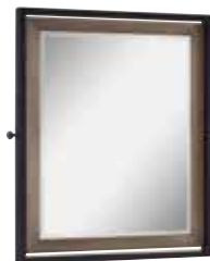
TILT MIRROR 5322033 / 33w x 2d x 35h 1" bevel glass. Shown on page: 7