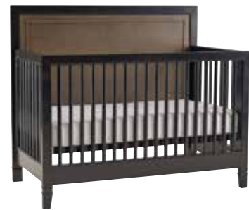
CONVERTIBLE CRIB 5322310 / 56w x 31d x 48h Shown on page: 22