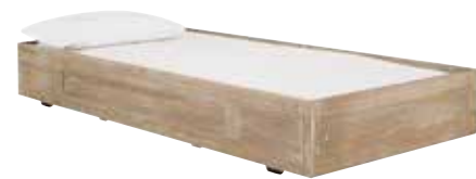
TRUNDLE 5321060 / 41w x 76d x 12h Trundle/Storage Unit fits under any bed. Wheels on bottom allow for easy pull-out. Fits standard sized twin mattress. Can be used as storage (two removable sliding storage trays included). Maximum recommended mattress dimensions: 74w x 38d x 8h