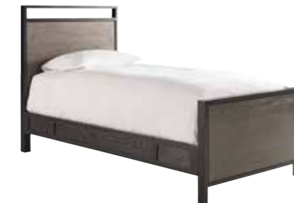
PANEL BED 5322037 / 3/3 Twin 41w x 82d x 50h 5322042 / 4/6 Full 56w x 82d x 50h (footboard height is 26") Shown on page: 10