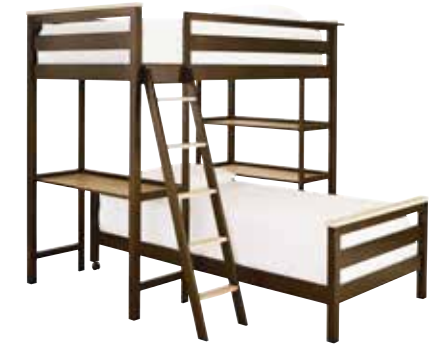
METAL LOFT BUNK BED 5321630 / 81w x 81d x 71h Includes loft, twin metal bed and ladder.