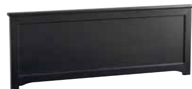
LOW PROFILE FOOTBOARD 5322284 / 58w x 3d x 22h Works with convertible crib to create full size bed that can accommodate under bed storage with use of this footboard. Shown on page: 22