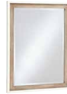
MIRROR 5321032 / 30w x 2d x 40h 1" bevel glass. Shown on page: 26