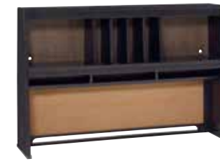
HUTCH 5322020 / 53w x 14d x 35h Removable dividers. Cork back panel. Cord exit in back panel. Shown on pages: 8, 19