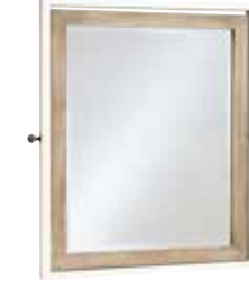
TILT MIRROR 5321033 / 33w x 2d x 35h 1" bevel glass. Shown on page: 28