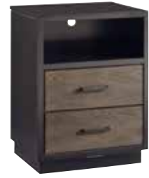
NIGHTSTAND 5322080 / 21w x 18d x 28h Flip top with power outlet. Two drawers. Open storage area. Light under case. Shown on pages: 10, 12, 18