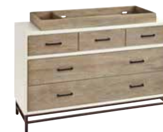
CHANGING STATION 5321200 / 43w x 18d x 5h Shown with 5321002 Dresser. Shown on page: 37