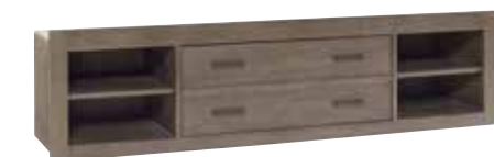
STORAGE UNIT 5322061 / 20w x 76d x 20h Integrates into any bed. Usable on left or right side. One large drawer with removable divider. One adjustable shelf in each open area. One storage unit and one rail shipped per order (up to two storage units can be used per bed). Shown on page: 19