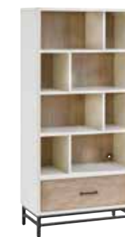
BOOKCASE 5321018 / 31w x 16d x 65h Three adjustable wood shelves. Cord exits in back panel. One drawer. Metal base. Shown on page: 29