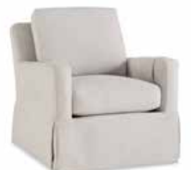
LULLABY GLIDER 687562-612 / 31w x 38d x 35h Shown on page: 22