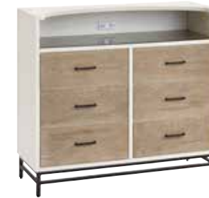
DRESSING CHEST 5321004 / 48w x 18d x 44h Six drawers. Removable dividers in the drawers. Smoked mirror top shelf. Power outlet. Metal base. Shown on page: 28