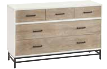
DRAWER DRESSER 5321002 / 54w x 18d x 34h Five drawers. Top right drawer has a removable felt tray/hidden storage. Removable dividers in the larger drawers. Metal base. Shown on pages: 26, 37