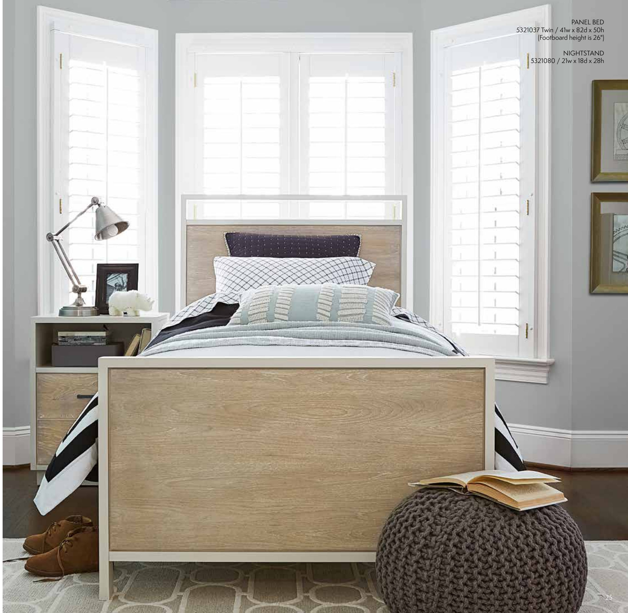
PANEL BED 5321037 Twin / 41w x 82d x 50h (Footboard height is 26")