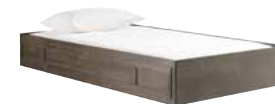
TRUNDLE 5322060 / 41w x 76d x 12h Trundle/Storage Unit fits under any bed. Wheels on bottom allow for easy pull-out. Fits standard sized twin mattress. Can be used as storage (two removable sliding storage trays included). Maximum recommended mattress dimensions: 74w x 38d x 8h Shown on page: 19