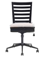
SWIVEL DESK CHAIR 5322071 / 26w x 26d x 37h Upholstered seat pad. Storage under seat pad. Shown on pages: 8, 10, 19, 20