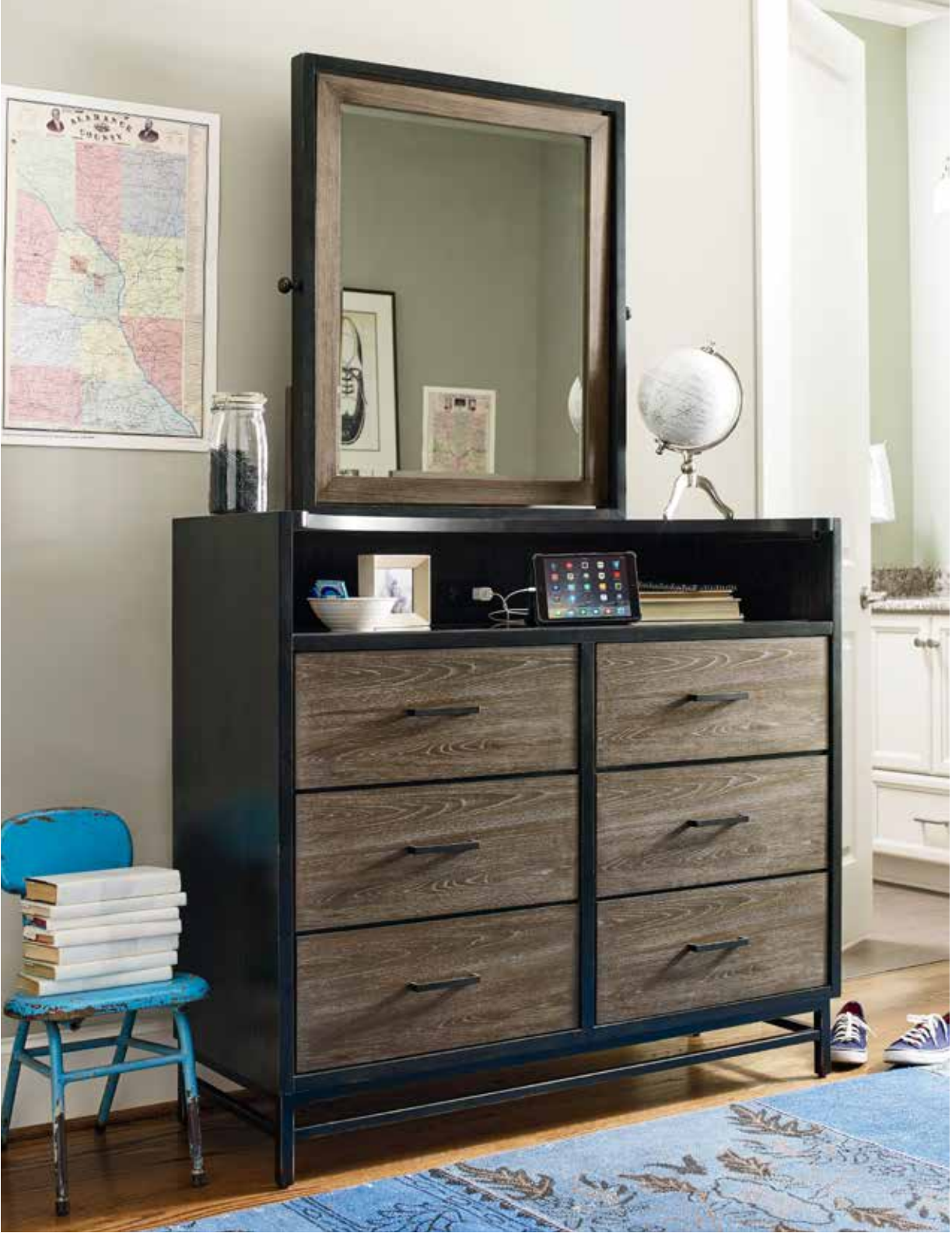
TILT MIRROR 5322033 / 33w x 2d x 35h