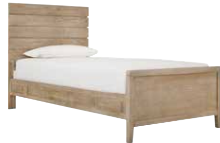
READING BED 5321035 / 3/3 Twin 43w x 80d x 47h 5321040 / 4/6 Full 58w x 80d x 47h (footboard height is 22") LED flex reading light in headboard. Shown on page: 32