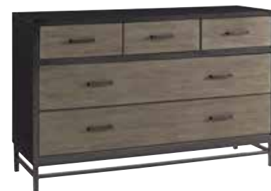
DRAWER DRESSER 5322002 / 54w x 18d x 34h Five drawers. Top right drawer has a removable felt tray/hidden storage. Removable dividers in the larger drawers. Metal base. Shown on pages: 9, 23