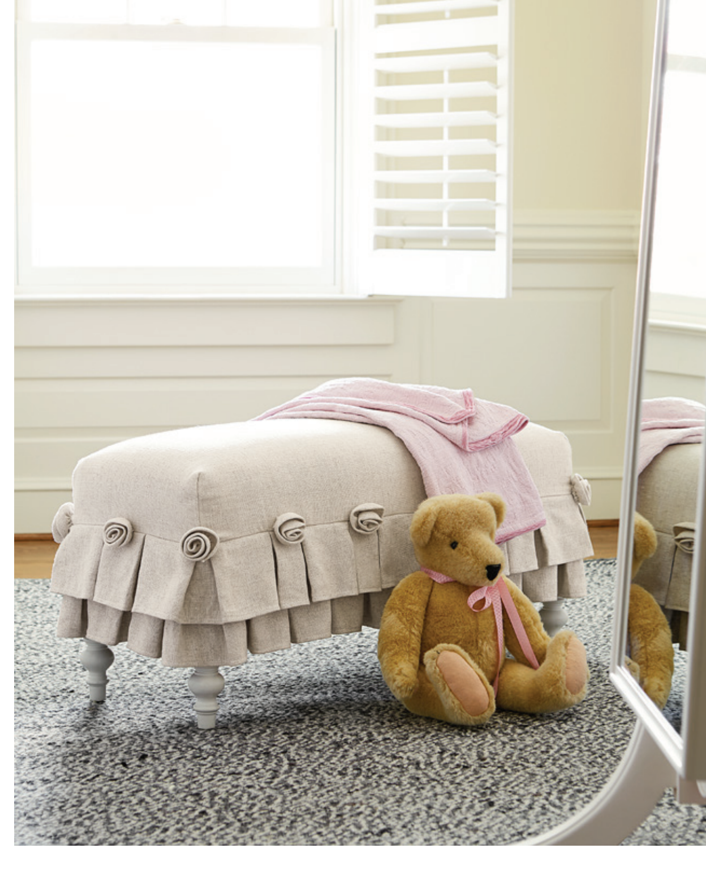
Bed End Bench 434A075 / 38w x 15d x 18h

Ma Cherie Metal Bed 434A036 Twin 40w x 80d x 57h (footboard height is 33")