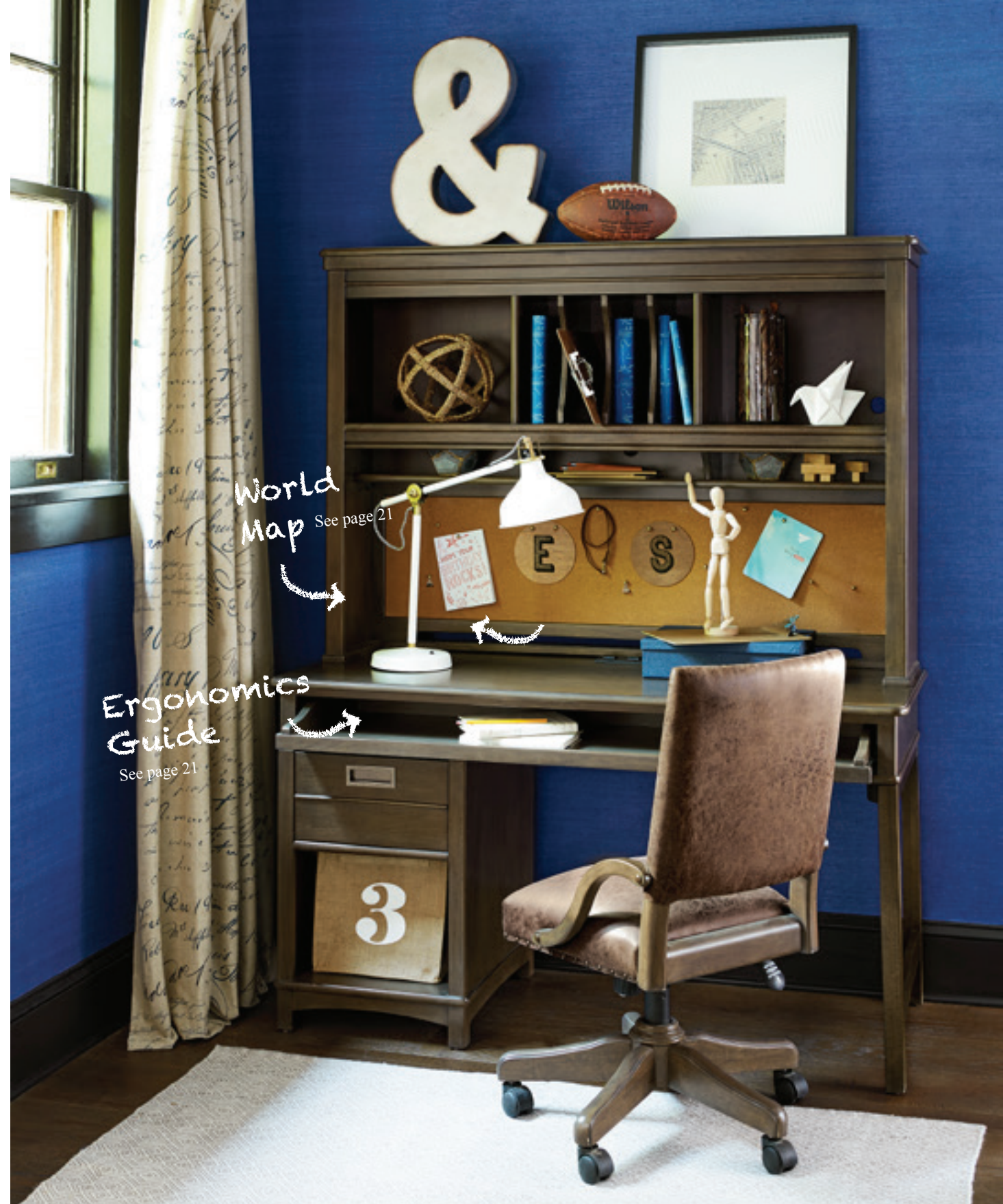
Hutch 5351020 / 54w x 12d x 38h