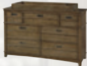
5351200 CHANGING STATION 43W x 18D x 5H • Shown with 5351002 Dresser Shown on page: 5