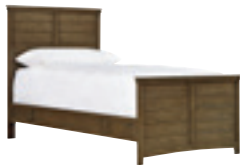
READING BED 5351035 3/3 Twin 5351040 4/6 Full Twin Bed: 43W x 80D x 50H Full Bed: 58W x 80D x 50H (footboard height is 26") • LED flex reading light in headboard Shown on pages: 14, 18