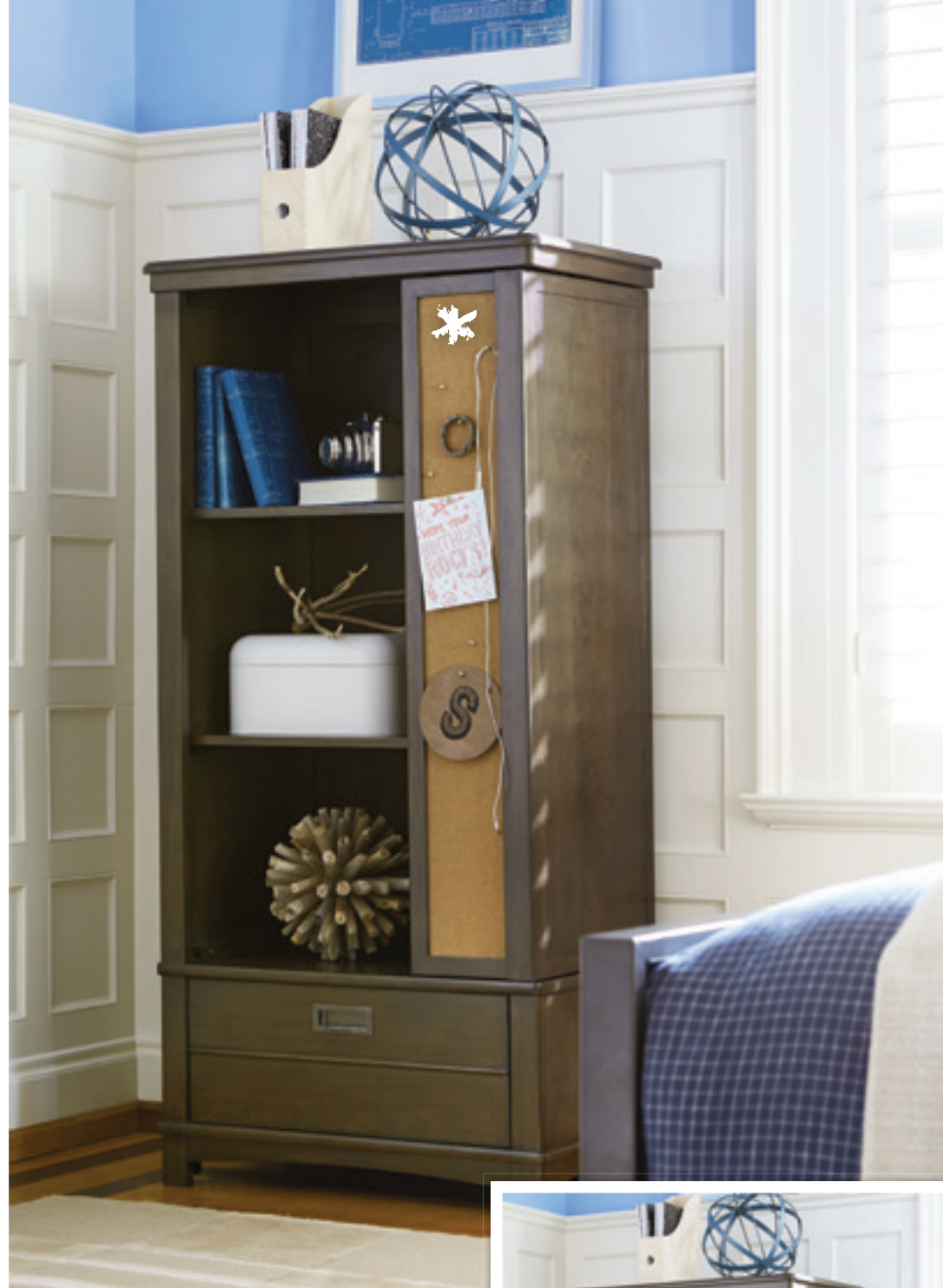
Bookcase 5351018 / 30w x 18d x 61h

*smart Hang memories on this corkboard panel. Open to reveal more storage!