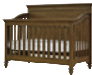
5351310 CONVERTIBLE CRIB 59W x 32D x 48H Shown on page: 4