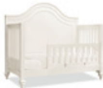
Toddler Bed Requires optional toddler rail.