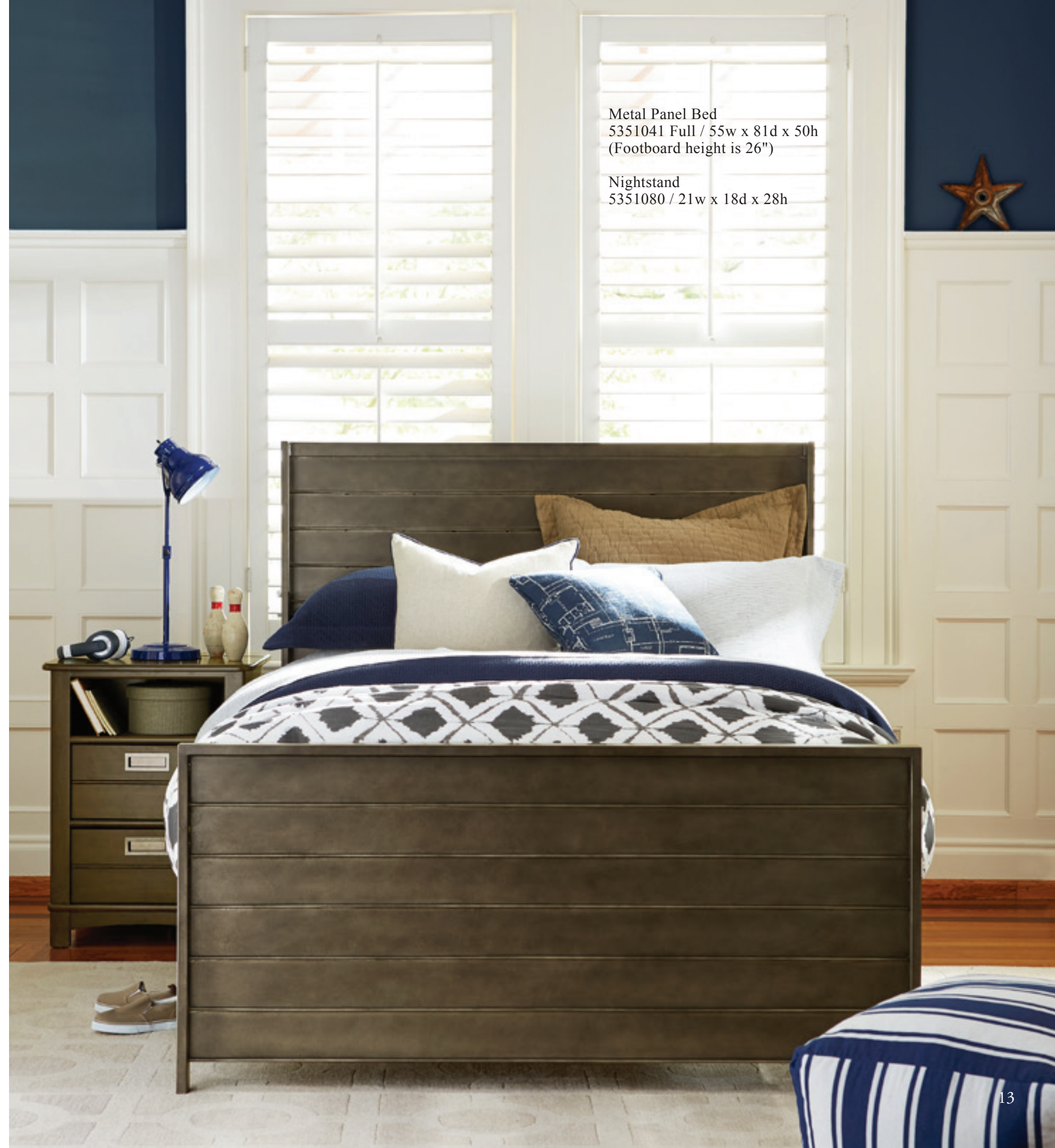
Metal Panel Bed 5351041 Full / 55w x 81d x 50h (Footboard height is 26")