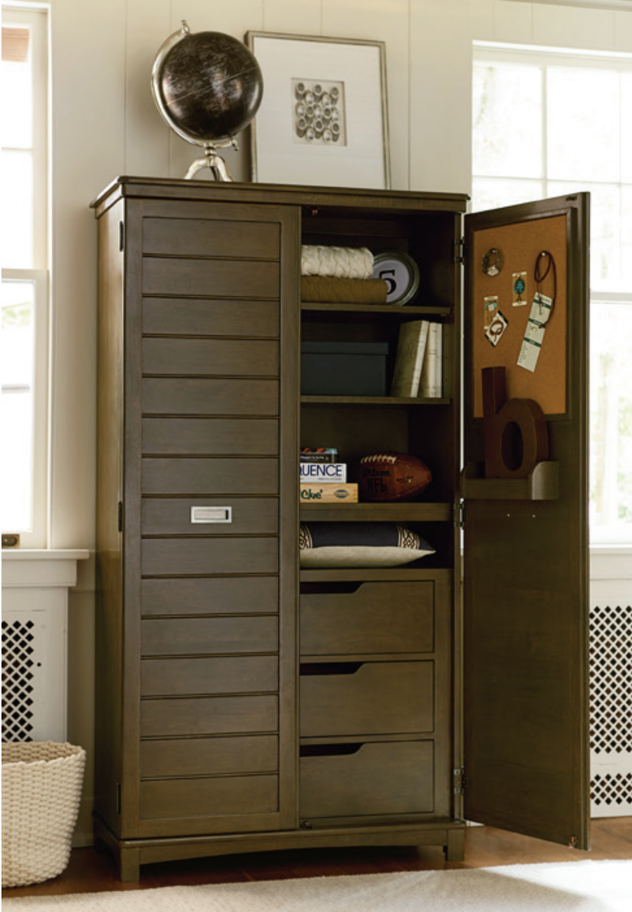
Wardrobe 5351014 / 33w x 18d x 74h