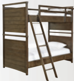
5351530 COMPLETE BUNK BED 3/3 Twin over Twin: 43W x 81D x 74H 5351540 COMPLETE BUNK BED 4/6 Full over Full: 58W x 81D x 74H • Bunk bed can break down into two separate beds • Accommodates Trundle or Storage Unit