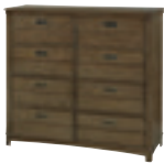
5351004 DRESSING CHEST 50W x 18D x 45H • Eight drawers • Top left drawer has a flip down drawer front and full extension guides • Top right drawer has a removable felt tray/hidden storage • Removable dividers in the larger drawers Shown on page: 9