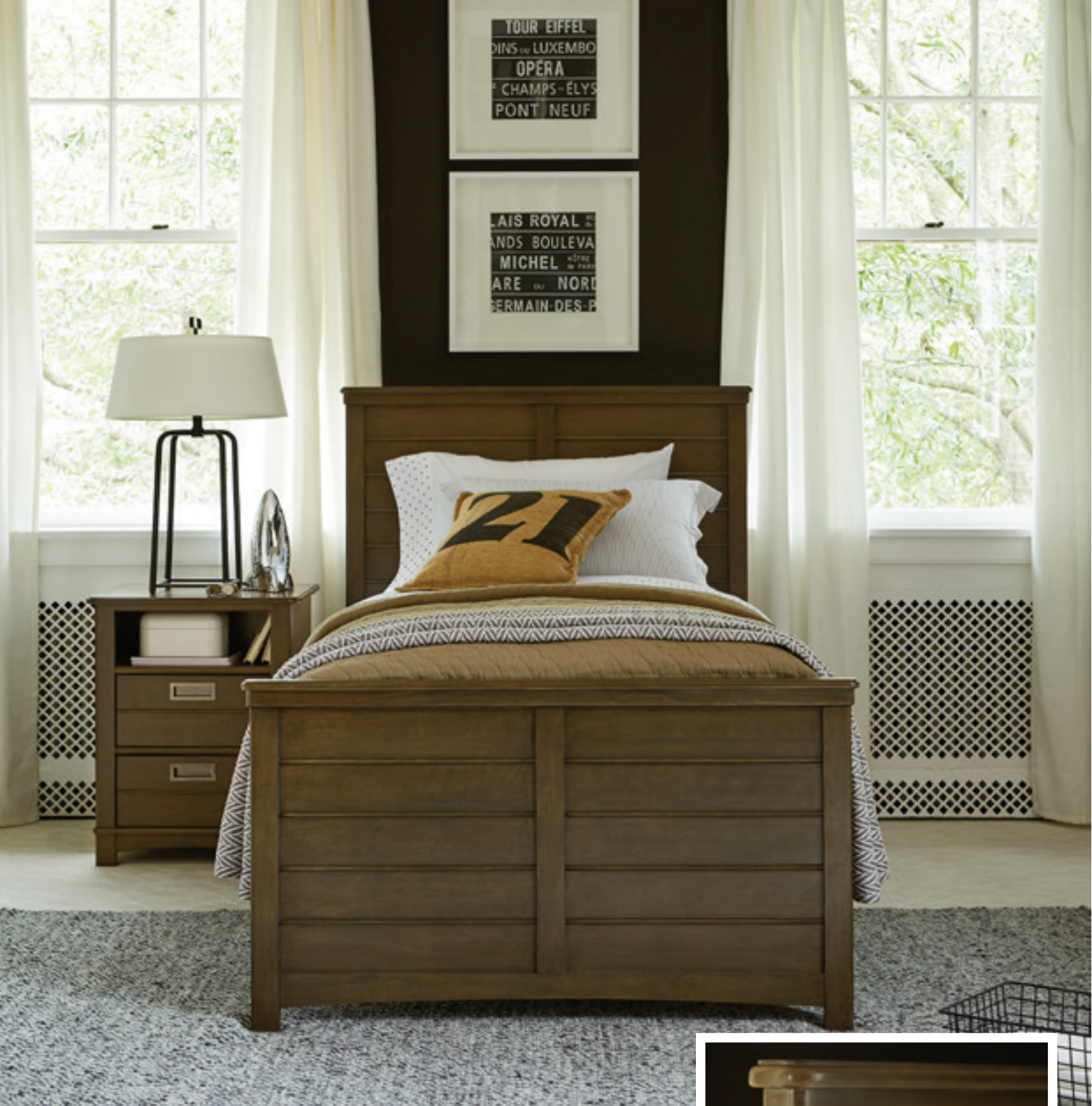
Reading Bed 5351035 Twin / 43w x 80d x 50h (Footboard height is 26")