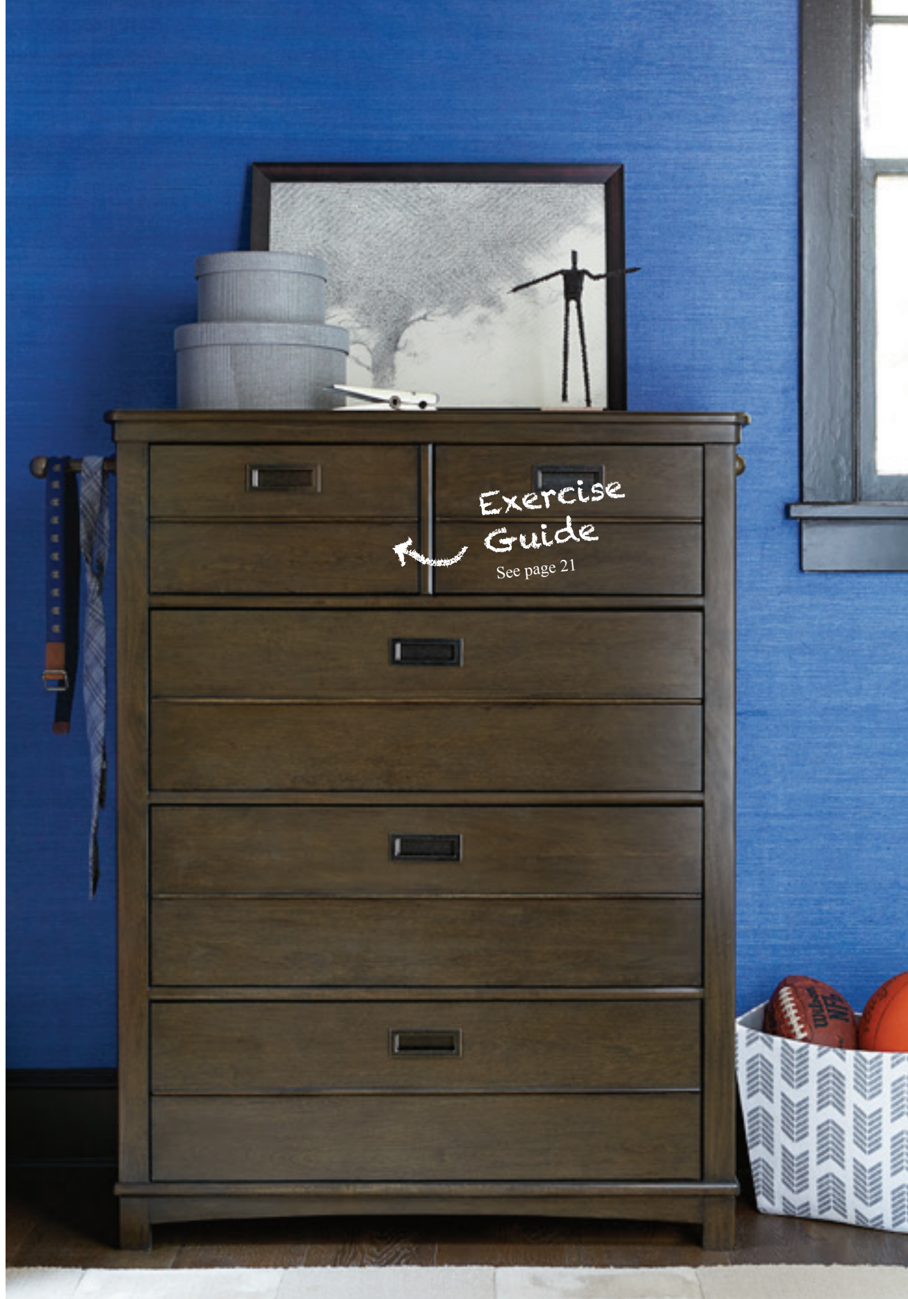
Drawer Chest 5351010 / 40w x 18d x 52h