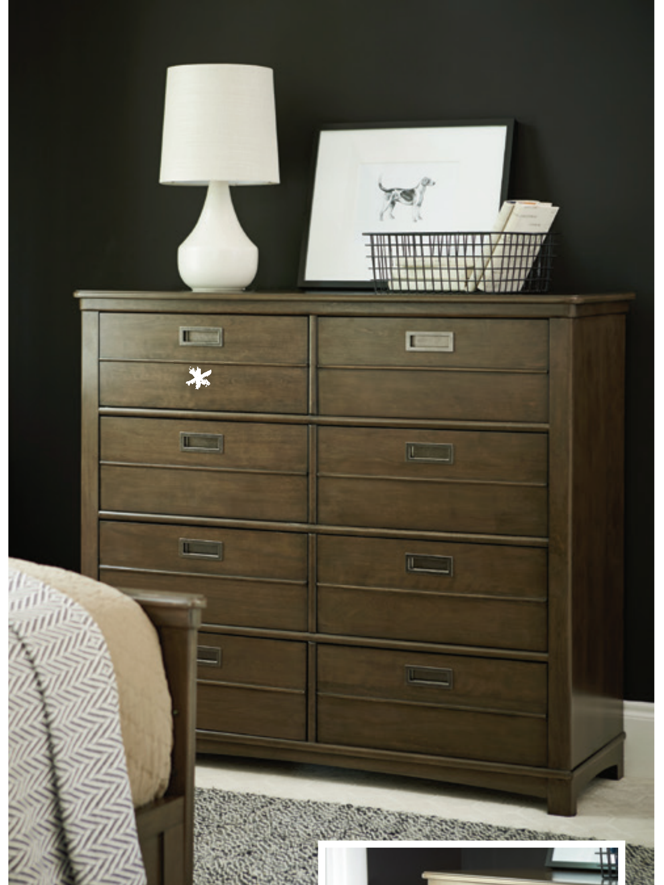
Dressing Chest 5351004 / 50w x 18d x 45h

*smart Top drawer flips down to store your favorite things.