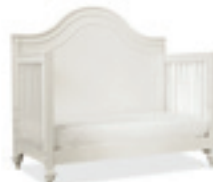
Day Bed Requires optional toddler rail.