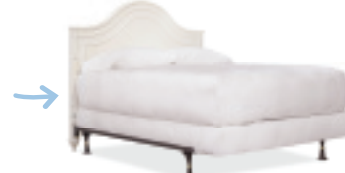
Full Size - Headboard Only Requires metal bed frame.