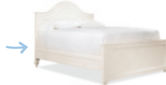
Full Size with Low Profile Footboard Requires optional footboard, slat roll, and bed rails.