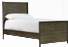
METAL PANEL BED 5351036 3/3 Twin 5351041 4/6 Full Twin Bed: 40W x 81D x 50H Full Bed: 55W x 81D x 50H (footboard height is 26") Shown on pages: 6, 13