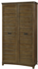
5351014 WARDROBE 33W x 18D x 74H • Two adjustable shelves • Stationary shelf • Inside LHF door has mirror and storage box • Inside RHF door has cork board and storage box • Open area in back panel for wire management • Three tray drawers Shown on page: 8