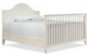
Full Size Requires bed rails and slat roll.