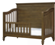
5351305 TODDLER BED CONVERSION KIT 58W x 3D x 33H • Kit works with convertible crib to create Toddler or Day Bed Shown on page: 4