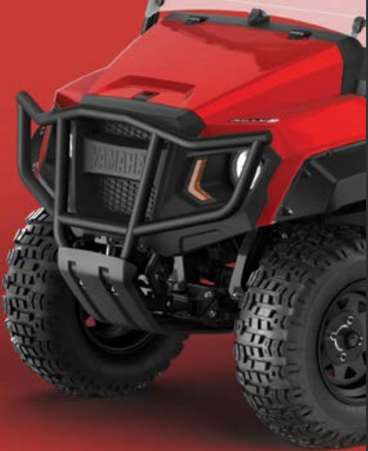
CORAL RED METALLIC