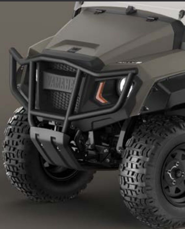
TITAN MATTE 17