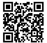
Scan for a digital copy of this brochure

This document contains many of the valuable trademarks and service marks owned and used by Yamaha throughout the world. The document may also contain references to other company, brand, and product names that may be the trademarks/service marks of their respective owners. Unless noted otherwise, these company, brand, and product names are used herein for identification purposes only, and reference to any names, marks, products, or services of third parties do not constitute or imply endorsement, sponsorship, or recommendation of the third party or the product or services. Products and specifications are subject to change without notice.