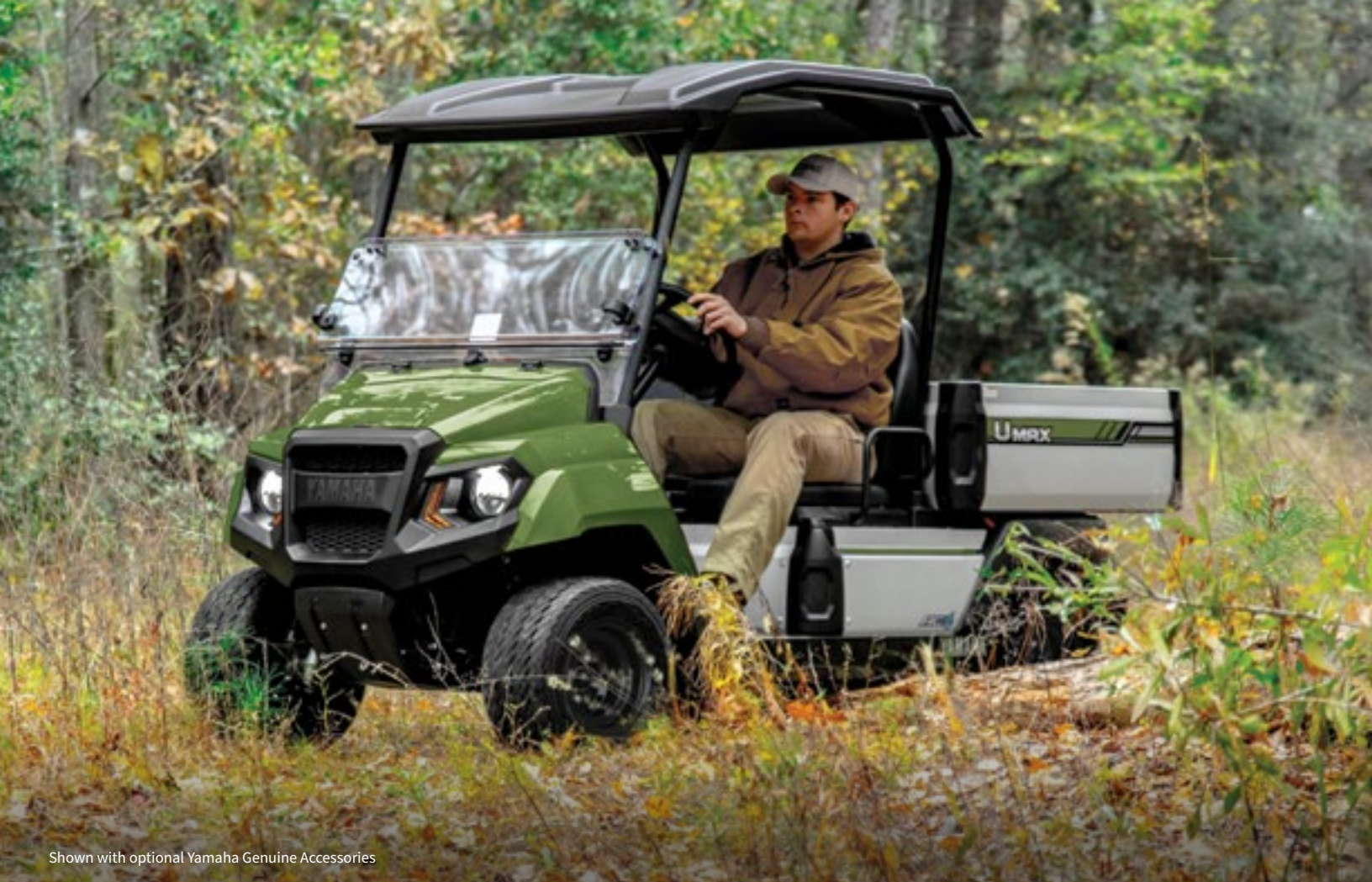
Shown with optional Yamaha Genuine Accessories