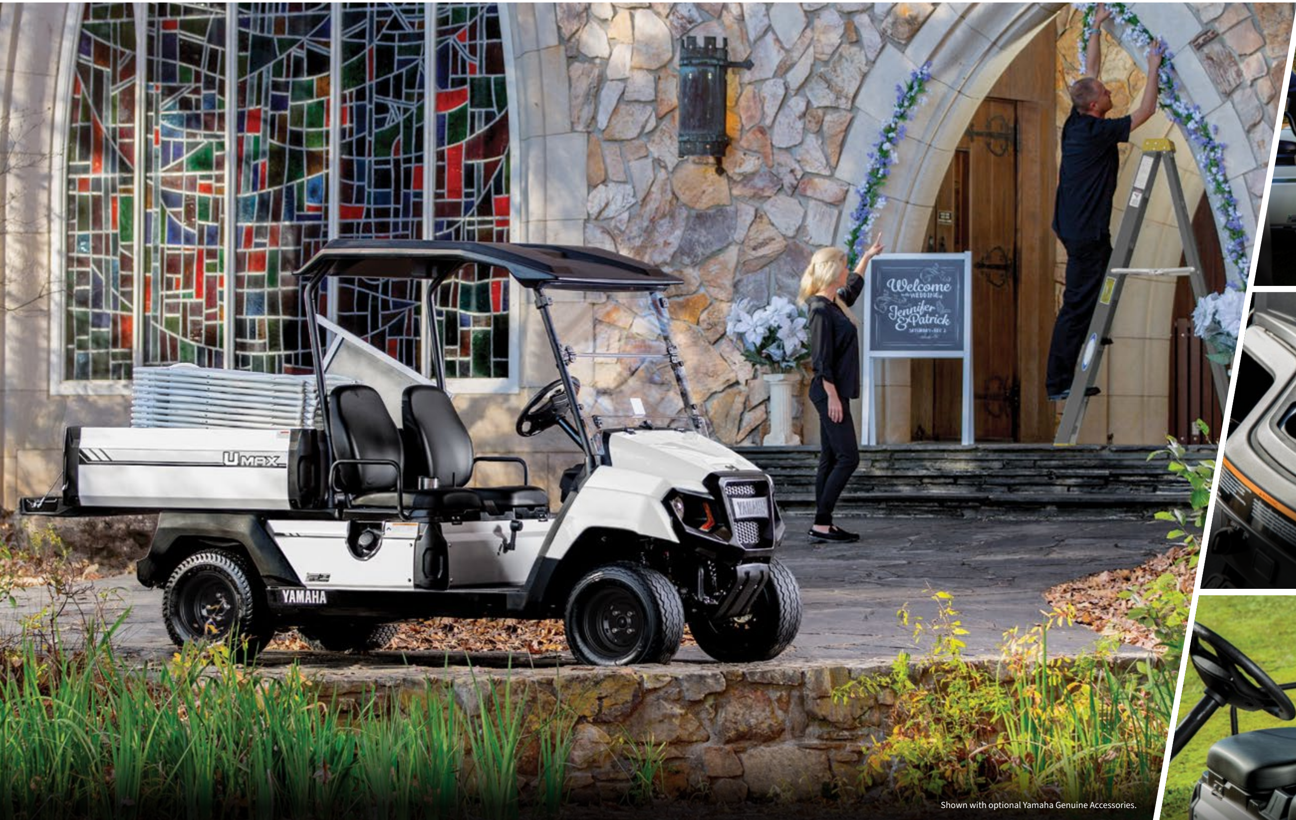
Shown with optional Yamaha Genuine Accessories.