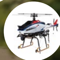
REMOTELY PILOTED HELICOPTERS

UMAX® CARS ..... 7 - 16 DRIVE² CARS ..... 17 - 26 PARTS AND ACCESSORIES ..... 27 - 28